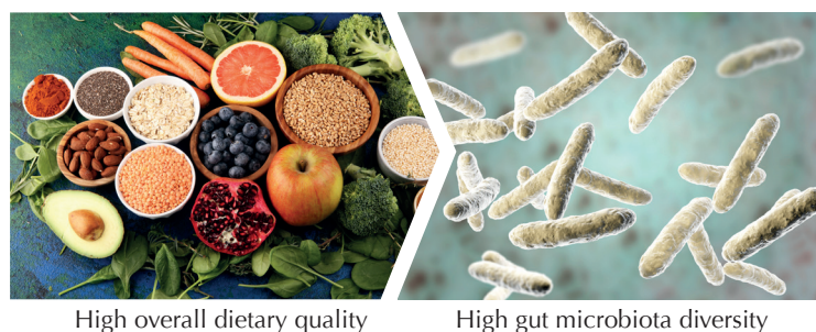
Figure 1. Overall diet quality relates to gut microbiota

Our study, alongside with previous evidence, indicate that high diet quality and an overall healthy dietary pattern relates to gut microbiota composition that is generally considered beneficial for health (Figure 1). Thus, modulation of gut microbiota by diet may offer opportunities for advancing health.